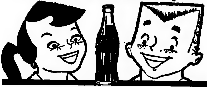
BOTTLED UNDER AUTHORITY OF THE COCA-COLA COMPANY BY

NEW BERN COCA-COLA BOTTLING WORKS, INC. NEW BERN, N. C.