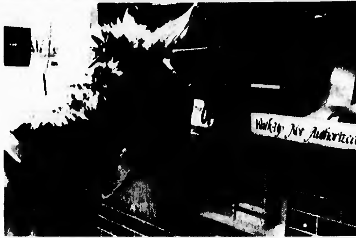
GREEN STUFF TASTES GOOD . . . The new drive-in window at the Fort Carson National Bank in Colorado was checked out by Comanche, a lady burro that is the Fort's senior mascot.

This isn't just true during our fleeting years as a teen-ager. The adults we love and respect have the same fine qualities that we want to strive for. They probably developed these qualities when they were teen-agers, and the characteristics