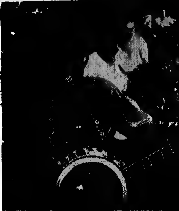
FOOT-STOMPING MUSIC ...String-thumping, clog-dancing mountain music Virginia style... here at the Galax Old Fiddlers' Convention and at other musical happenings throughout Virginia this spring and summer.

The adoption of this measure would provide budget control by creating standing committees on the budget in both Houses of Congress, establishing a Congressional Office of the Budget equivalent in status to the General Accounting Office, moving up the date of submission of the President's Budget from January to November 15 each year, providing for congressional