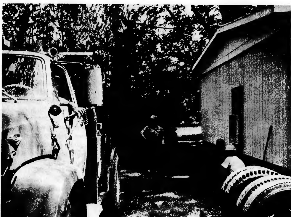
Workers getting the new Highlights office ready for occupancy. The new office is located beside Cannon's Variety Store on Main Street in Vanceboro.