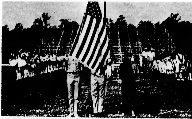
Dolphins open season at West Craven. Last year the Vanceboro area midget football team was Conference Champion.

It meets the first Monday night in each month.