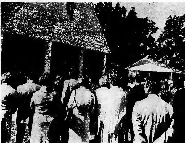
Epworth congregation gathers to dedicate new memorial steeple.

Tickets for the dinner are now on sale. You may purchase them from any lady of the organization. Please feel free to call on any of the Holly Hill women about bringing advance tickets to anyone who desires them.