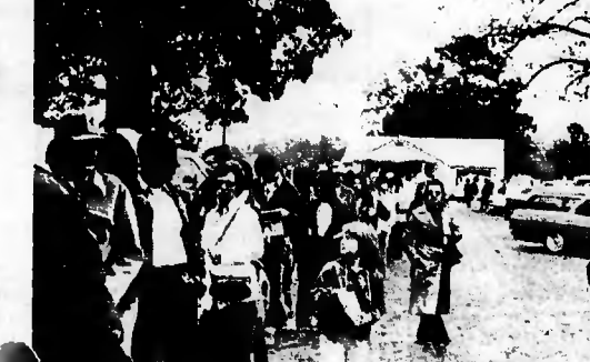
supporters await lunch at the Ft. Barnwell Fireman's Day show off new Ft. Barnwell fire truck.