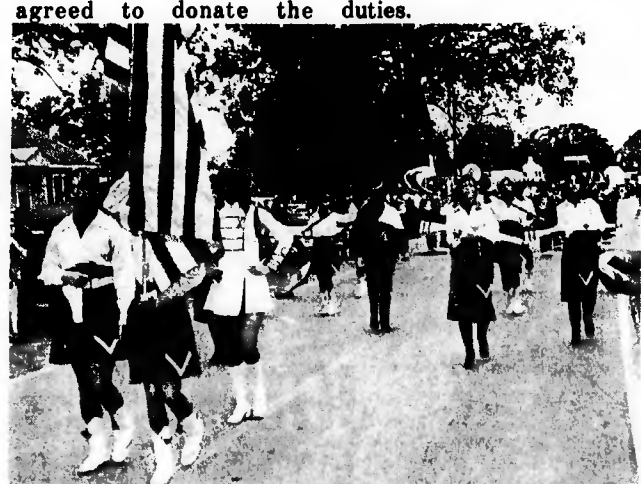
FIRST CLASS-The award-winning West Craven High School Marching Band performs at the Ft. Barnwell Fireman's Day last Saturday.