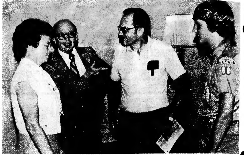
WILKERSON'S OPENS — S.G. Wilkerson & Sons opened their new funeral home facility in Vanceboro with a dedication ceremony last Sunday at 3:00 p.m. Over 200 people gathered in the air-conditioned chapel of the new building for the services. Afterwards guests were invited to tour the facility.

The funeral home will be open from 9:00 to 5:00 on Monday and Thursday. In addition to being open all day whenever there is a death in the area. However, burial assistance is available anytime by dialing 244-0771.