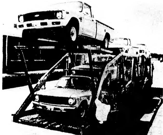
A TRUCKLOAD OF ENERGY SAVINGS — The North Carolina Department of Transportation recently received a delivery of subcompact pick-up trucks which will replace more than 500 of the departments' full size pick-ups. An estimated 320,000 gallons of motor fuel per year will be conserved as a result.

Following opening ceremonies at 9:30 a.m. the New Bern High School Band performed at Center Court. Other activities during the day included "Buttons the Clown" Shows at 11:00, 2:00, and 5 p.m. and a "Shelton and Huttlinger" Concert at 7 p.m. Different activities are planned for today, Friday, and Saturday, climaxing on Saturday night with a big Grand Opening Fireworks display at 9:15 p.m.