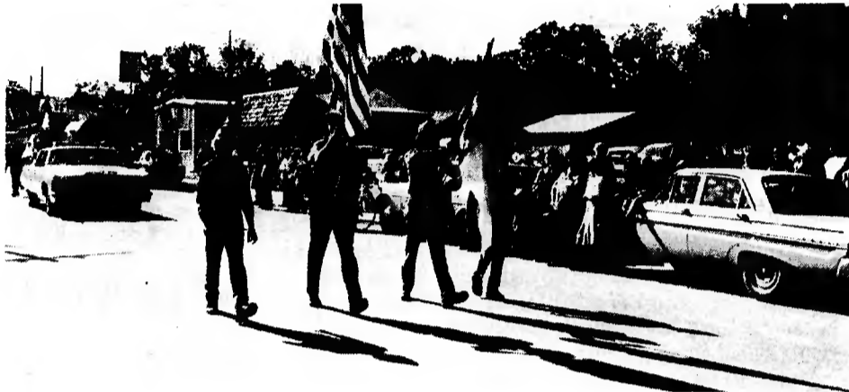
PARADE — The 1979 Fireman's Day Parade was the biggest and best ever. Boy Scout Troop 58 leads off the Parade.

And this is indeed our parade. We may enjoy watching the more famous parades on television and certainly the Macy's Christmas Parade or the Rose Parade are spectacular, but how many people do we know on those floats or riding those horses. Those parades are fun to watch, but they do not hold the excitement of the Fireman's Day Parade. This excitement is felt by young and old alike as they strain to be the first to see the Boy Scout color guard which signals that the parade has begun. "Here it comes!" can be heard up