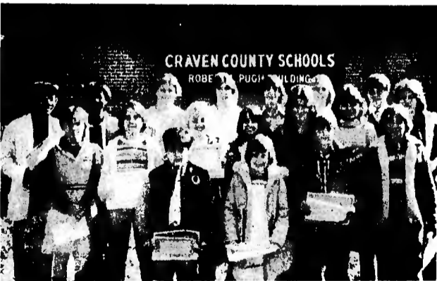
WINNERS— Students in Craven County Schools participated in American Education Week contests. Above are the area winners in the essay and recitation contests.