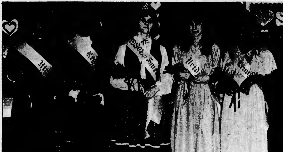
1980 SWEETHEART COURT - The West Craven Junior High School Sweetheart Court was named at the school dance last Friday night. The