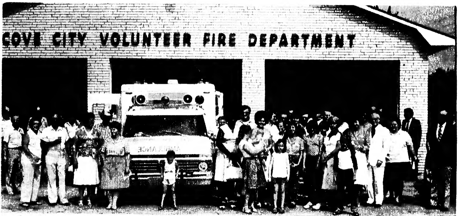
Approximately 200 Cove City residents turned out for the dedication of the new Cove City Rescue Squad at the ceremonies on Sunday, August 16th. Activities for the