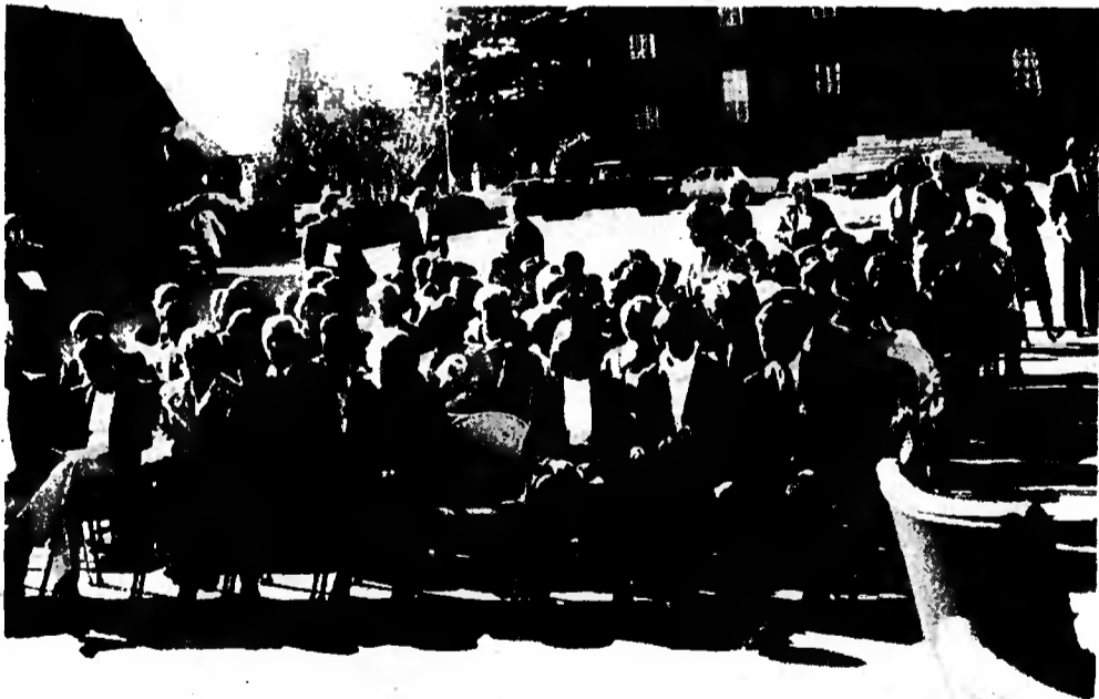
Dignitaries and guests at the New Bern-Craven County Board of Education Dedication Ceremonies