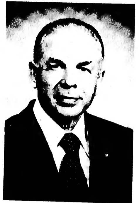
In appreciation of an unselfish and exceptional contribution to the growth of a student-oriented educational program in the New Bern City and Craven County Schools.