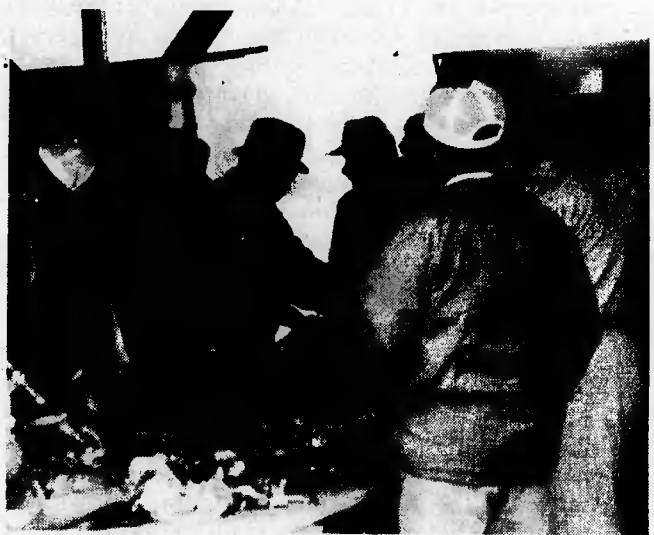
Chopping Barbecue Township 9 Fire Department.