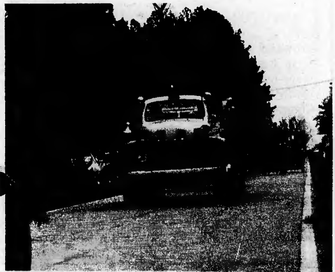
Here Comes The Parade!