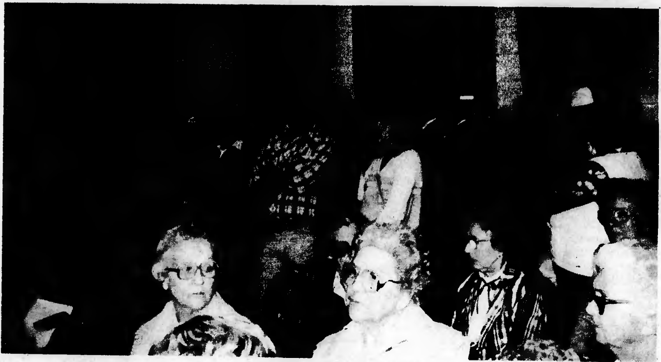
Vanceboro Town Meeting