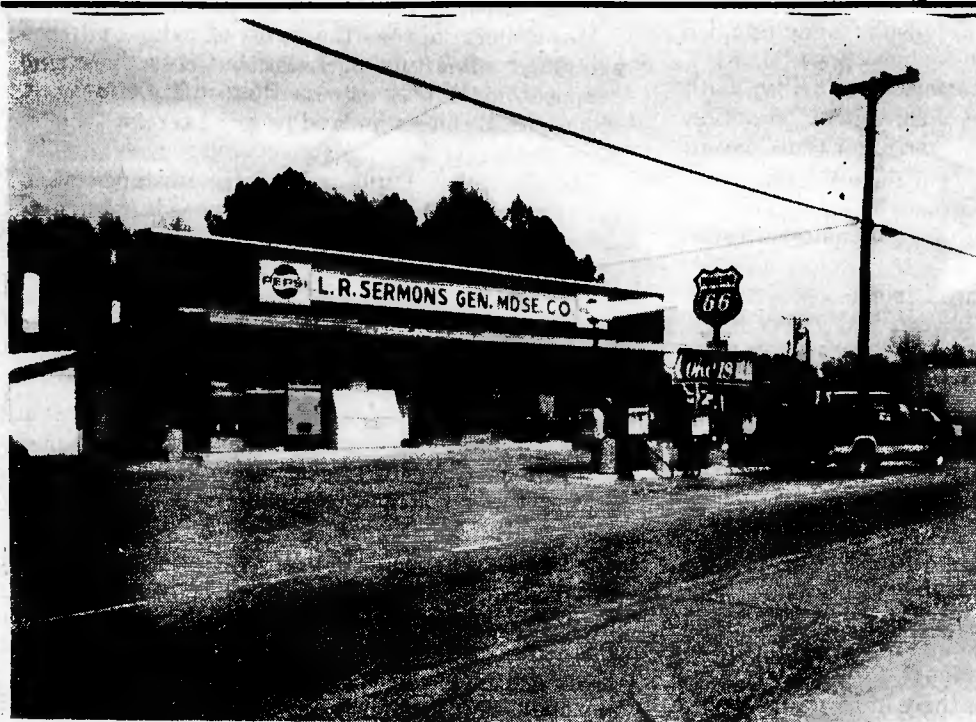
L. R. Sermons Gen. Mdse. Co.