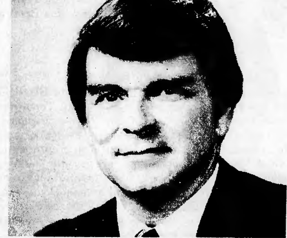
Senator Joseph Thomas