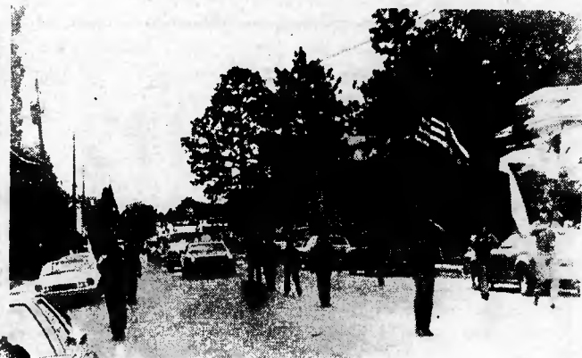
Everyone loves a Parade

Excitement will prevail at 10:00 a.m. on Saturday, May 22nd, as the parade will begin the events of the Rescue Squad Day ... West Craven Marching Band ... Antique Cars ... Corvettes ... and at 11:00 a.m. barbecue pork and chicken dinners will be ready for serving ... $3.00 donation ... Bake Sale ... Other events included in the day's plans will be "The Princess Contest," "The Gabriels", and rides.