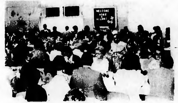
Welcome Home Alumni !!