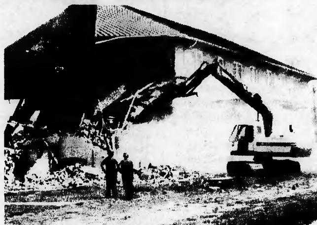
FARM LIFE SCHOOL-circa 1925-1982

AND THE WALLS CAME TUMBLING DOWN —Last week the old Farm Life School Main Building made her last stand and former students would have been proud of how hard it was for a seven man crew using a Drott-40 Backhoe to shake her foundation. Each dump truck load carried away weighs about 6-7 tons and at 60 loads a day, it will take about two weeks to do it all. The old cafeteria and connecting hallway took about 25 hours to bring down.