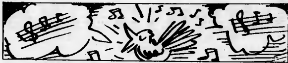
A mockingbird has been known to change its tune 87 times in seven minutes.