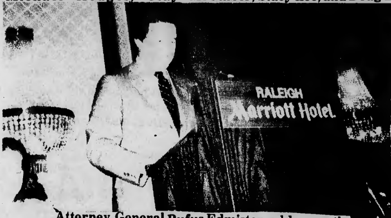
Attorney General Rufus Edmisten addresses the youth at the opening banquet of Youth Legislative Assembly in Raleigh.