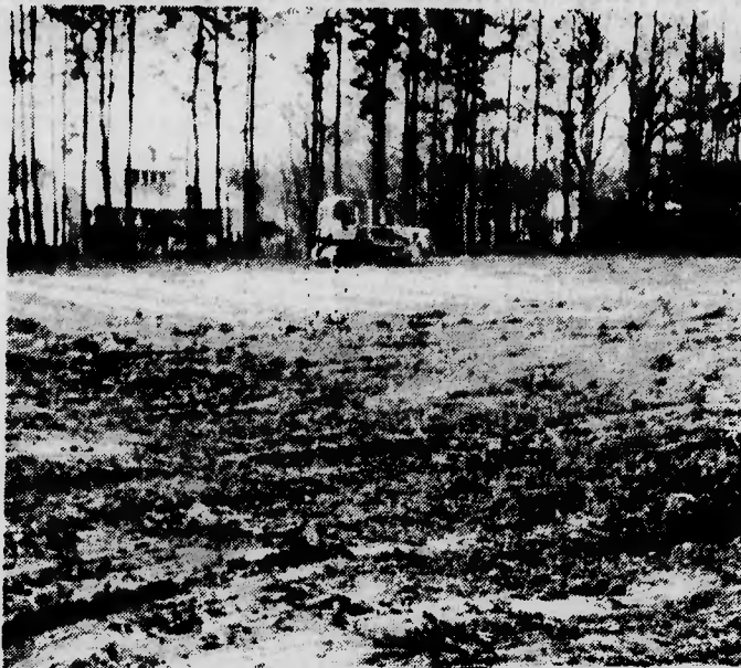
Parking lot for the softball field is being leveled for a rock covering.