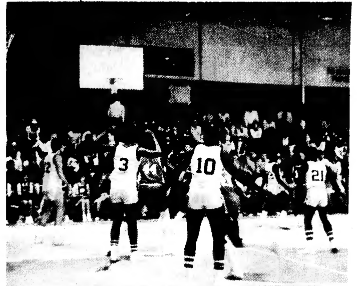
Scenes from tournament play between the Eagles and the Lakers.