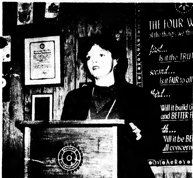
Dr. Beverly Perdue