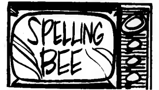
The first television panel game show was a six-a-side Spelling Bee, presented by the BBC May 31, 1938.

Sunday 12:00 noon to 6:00 p.m. Admission is free and the public is cordially invited to attend.