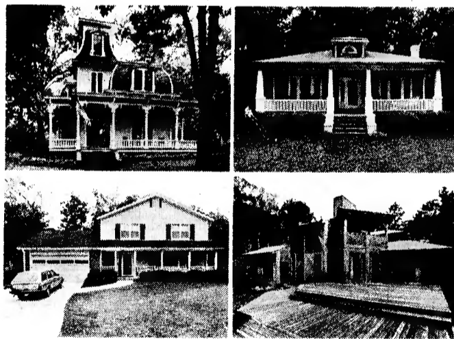
Savings based on houses with 1,500 square feet. Bigger houses save more.

to what we call "Common Sense" standards. And, even though it does cost a bit more to build, your energy savings of $20 to $30 a month make up the difference in a hurry.