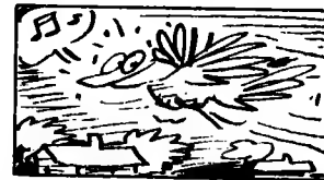
The nightingale, famed of song and lore, is found in Europe but is not native to anywhere west of the Atlantic.