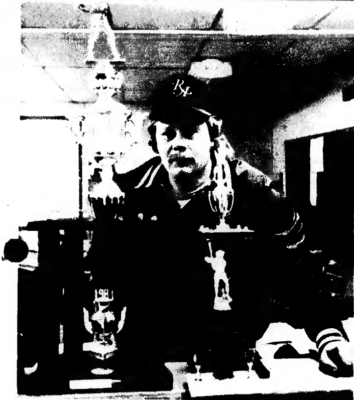
baseball news baseball news