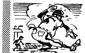
The Dodgers' Fernando Valenzuela is the first pitcher to win the Cy Young award and Rookie of the Year in the same year. He won them in 1981.