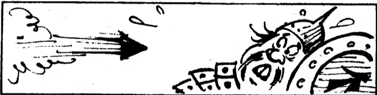
Early Chinese chronicles mentioned that the Chinese used rockets as weapons against the Mongols in 1232 A.D.

plan to hold Easter parties at the Caswell Center in Kinston and the pediatric wing of the Craven County Hospital. On May 22, a banquet is planned for the installation of next year's officers and induction of new members. The Junior Civitan has become very important to their community and West Craven with their special service projects.