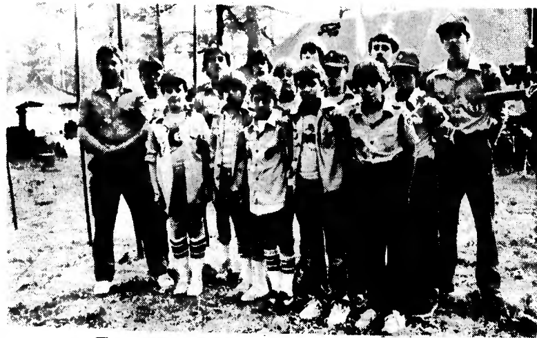
Troop 58, Vanceboro at Camporee 1984