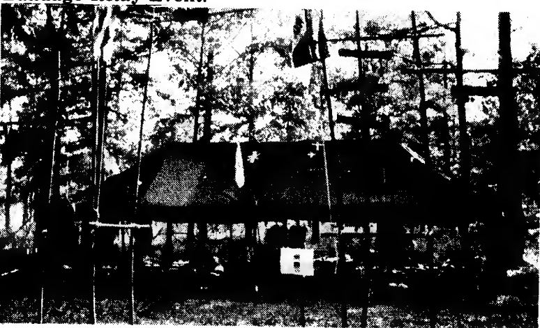
Home away from home for scouts.