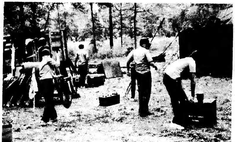
Break Camp and Head for Home.