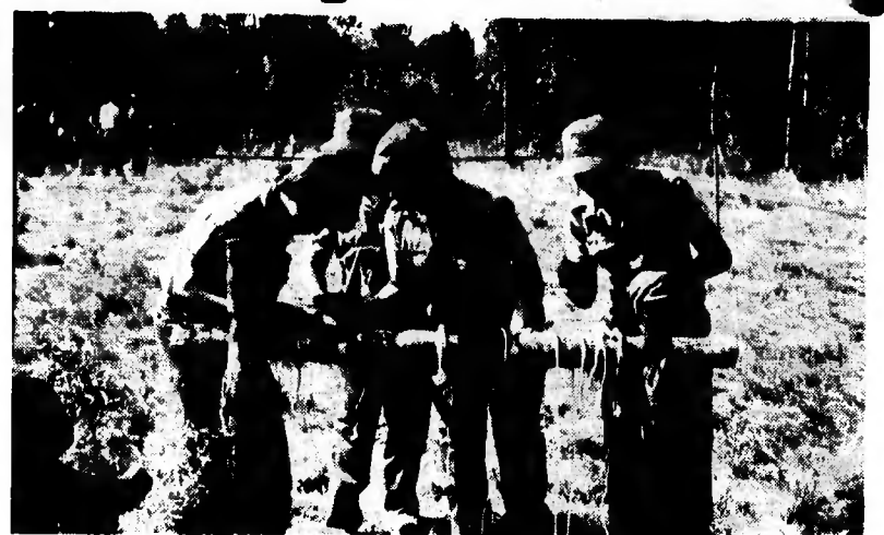
New Bern Scouts check knots at Knot Tying Event.