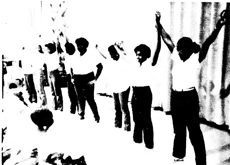
The WCHS Band/Choir Concert was a big success.