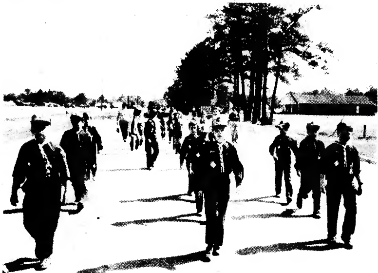
We are Cub Scouts, how do we look?