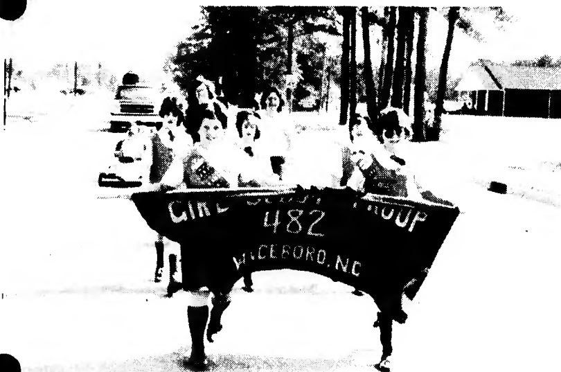
Girl Scout Troop 482 passes in revue.

Success it was! Parade, strawberry short cake & ice cream, crafts of all types, barbecue pork and chicken cooked to suit the taste, a big Strawberry Festival/Rescue Day Softball Tournament, and a beauty contest all went to make for a successful day in the history of Vanceboro.