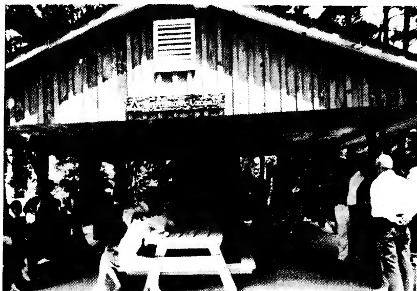
Dedication of the Weyerhaeuser Shelter in the Vanceboro Park.