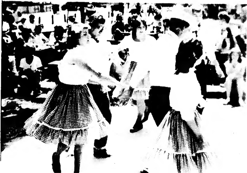
Craven County Cloggers doing their thing.