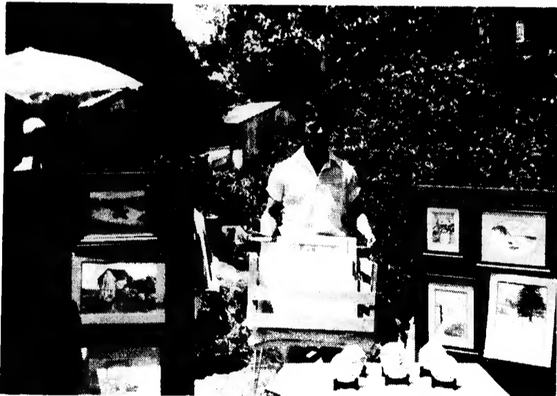
Paintings and Shell craft booth.