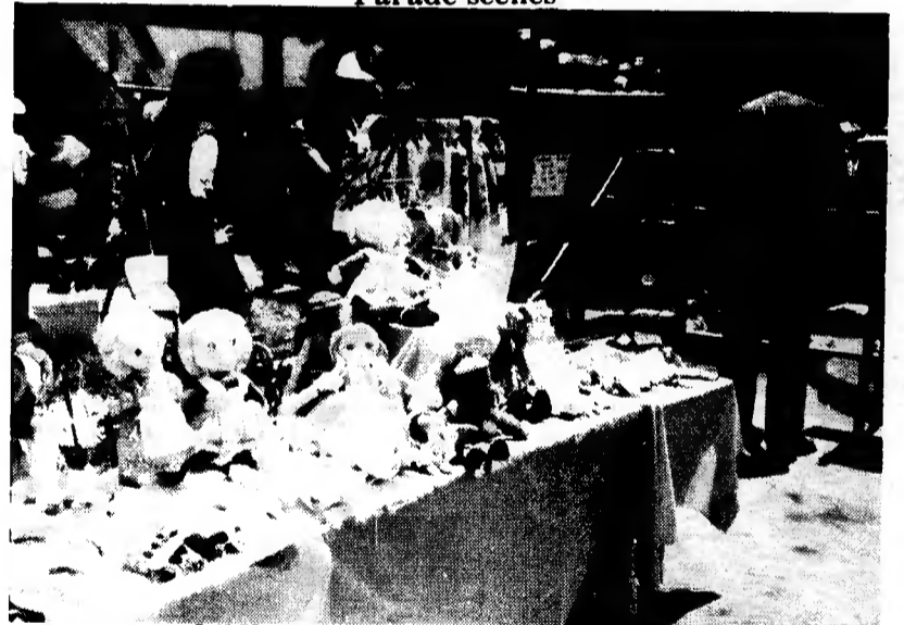
Dolls and Trinkets galore was the theme of this booth.