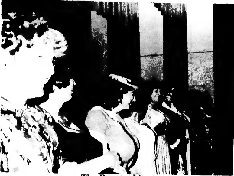
The Beauty Line