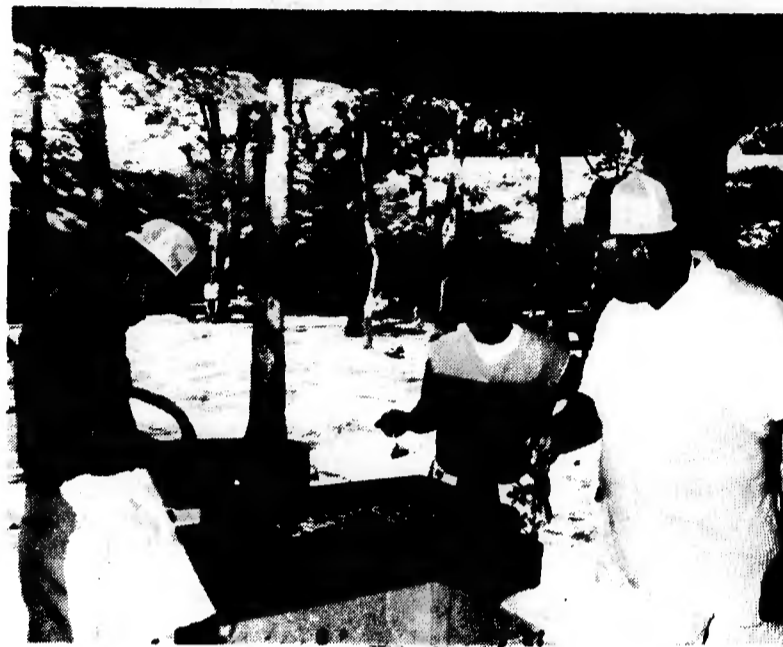
Three of the Woodmen are busy cooking hush puppies for the annual event.

Other items of interest for the Camp are: Swimming Pool, Gym facilities, Volleyball Court, Bath houses, and Cottages for 270 people.