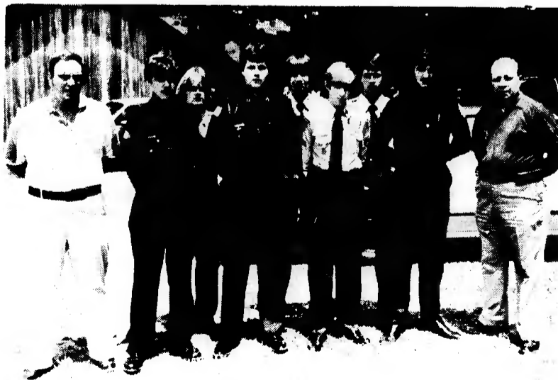
Mount Olive Police Explorer Post 46 on hand at WOW meet to aid with traffic control.