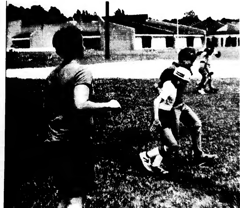
Three legged race