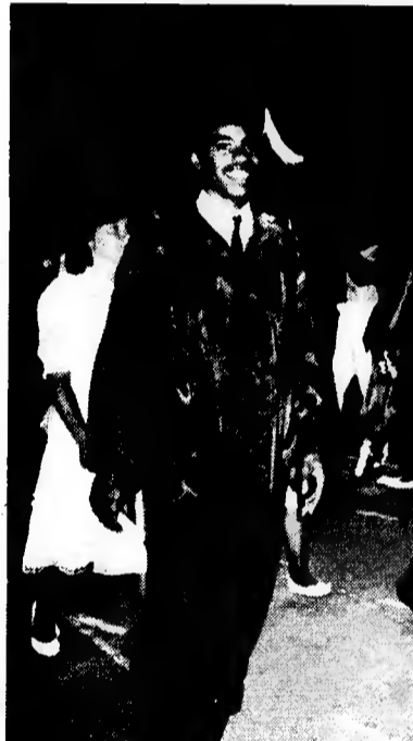
Ready to start on a new job