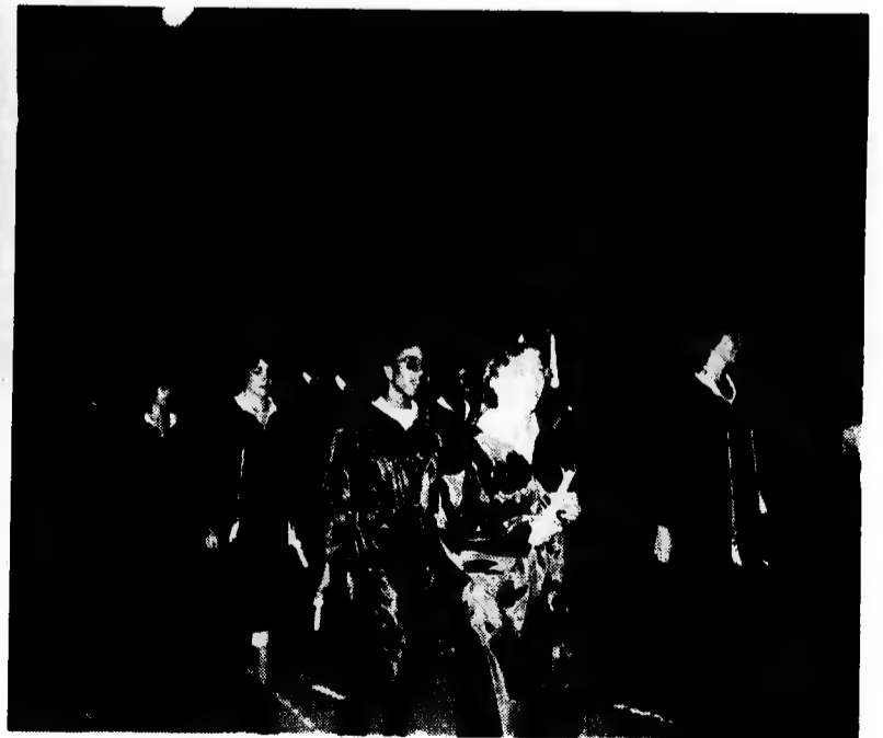
Graduates of 1984 - Proud to be graduates.