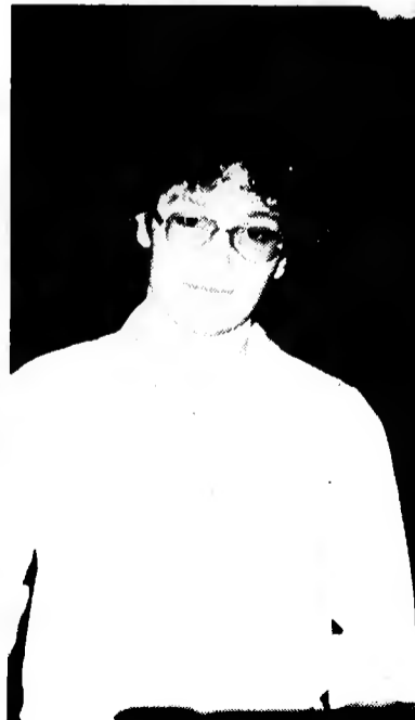
"Believe It or not!" I had to work and didn't get here in time to walk across.