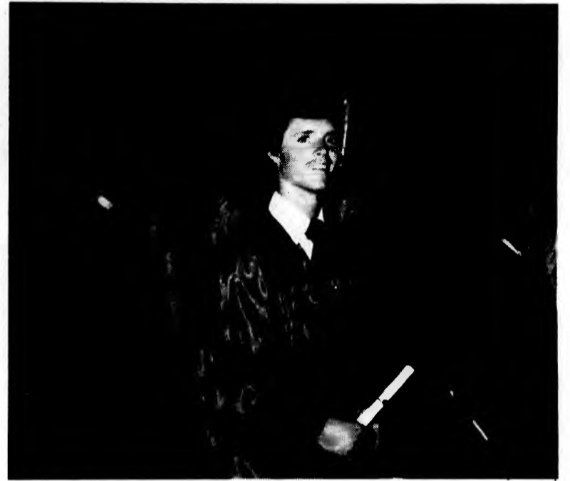
Look! I made it, Are you surprised?