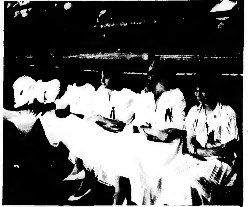
Junior Marshals waiting to carry out their duties.