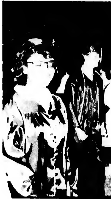
It's over - no more homework!