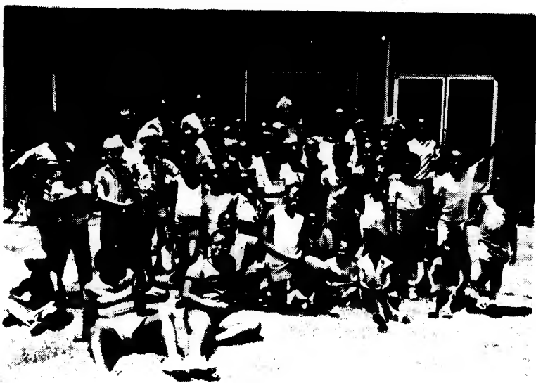
Day Camp group and director at Farm Life School gym.

Department of Commerce representatives visit each community to assure the standards have been met. Winning communities will receive highway signs designating them as winners. They are also given special promotional attention when working with industries looking for a plant site in North Carolina.