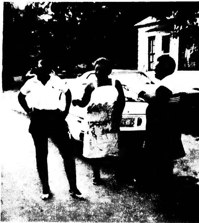
Dover is a friendly town as can be seen in the above street scene as a couple of unidentified residents joke with another resident about posing for a picture to be in the newspaper.

As for Cable TV for Dover, Cove City, and Fort Barnwell residents, the town is still waiting for the Craven County Commissioners to secure a release from Tar River Communications of these three areas. A private firm is ready to start laying cable as soon as the release is received.