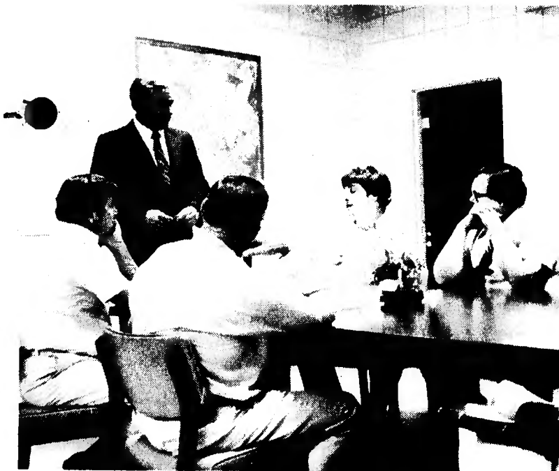
Town Board hears explanation of grant application.