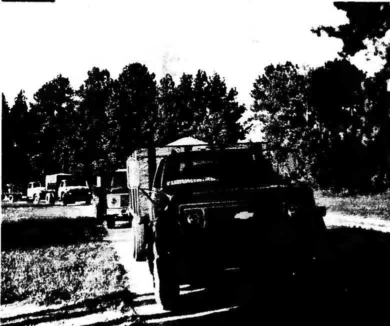
Long line of corn growers wait for their turn. Several nights the mill operated until midnight.