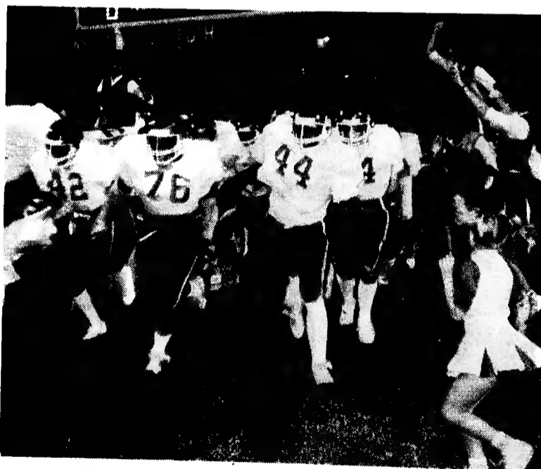
West Craven Eagles break through and are ready to meet the Pamlico Hurricanes.

The Eagles jumped out to a 28-0 halftime lead as Flute