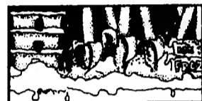
Banana Pops: Before they become too ripe, freeze whole bananas for banana-sicles.

"Ultrasuede Sewing Class" On Tuesday, October 16, 1984 from 7:00 p.m. - 8:30 p.m. the Craven County Agricultural Extension Service will feature an "Ultrasuede Sewing Class" at the Extension Office. Enjoy learning the latest techniques used when working with ultrasuede and bring any questions or problems you've had in the past. Call 633-1478 to register.