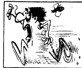
Stinging requires a bee to use 22 different muscles.

adjusted for historic seasonal trends and are adjusted to smooth statistical aberrations.