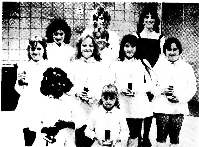
Cheerleaders for the Bandits