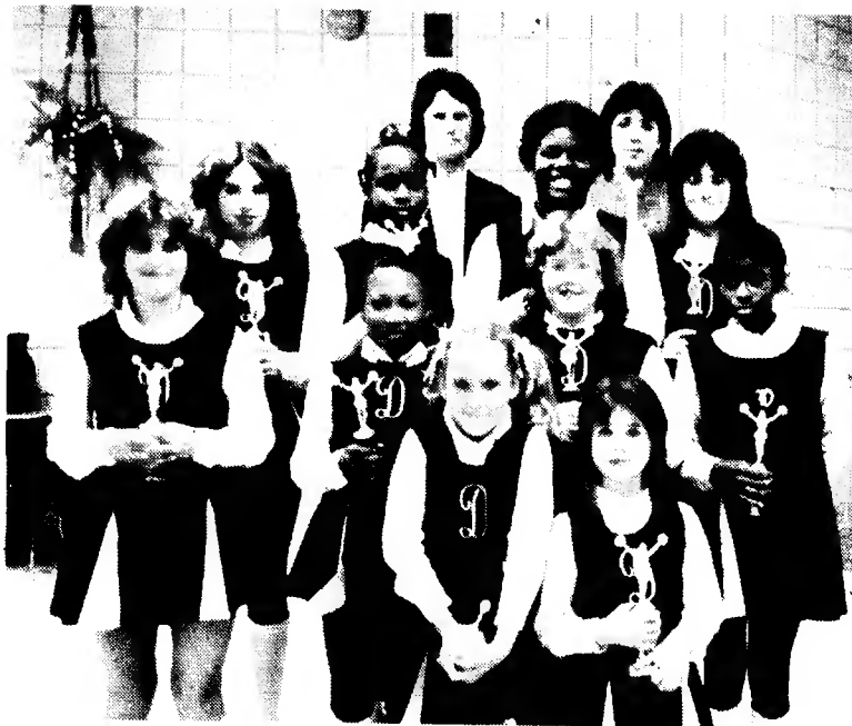
Cheerleaders for the Dolphins