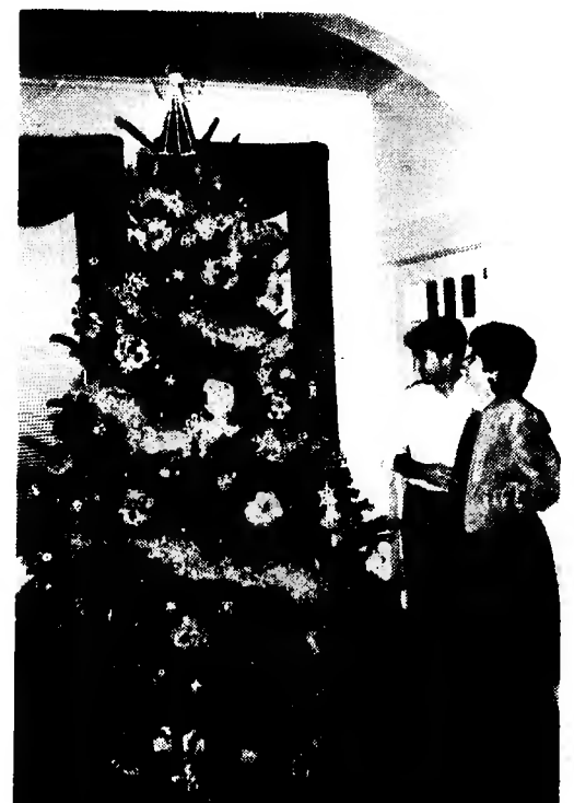
New Bern couple stand in awe over the Christmas tree in the Commission House during the Christmas Tour of the Tryon Palace. (More pictures on page 8)