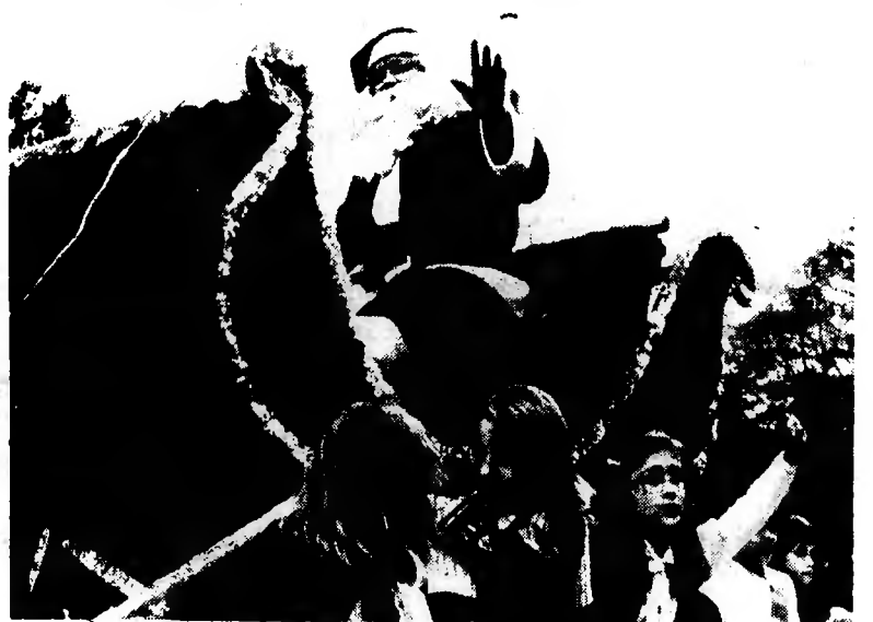
Santa Claus, as usual, a big hit in the New Bern Christmas Parade. (More pictures on page 14)