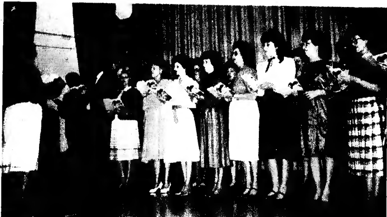
West Vanceboro Church of God