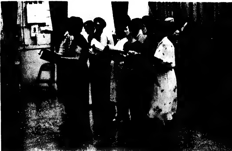
New Haven FWB Church Adult Choir