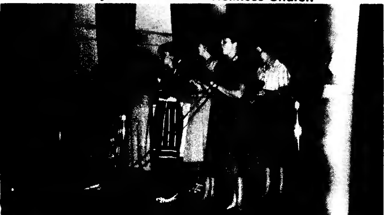
Vanceboro United Methodist Church