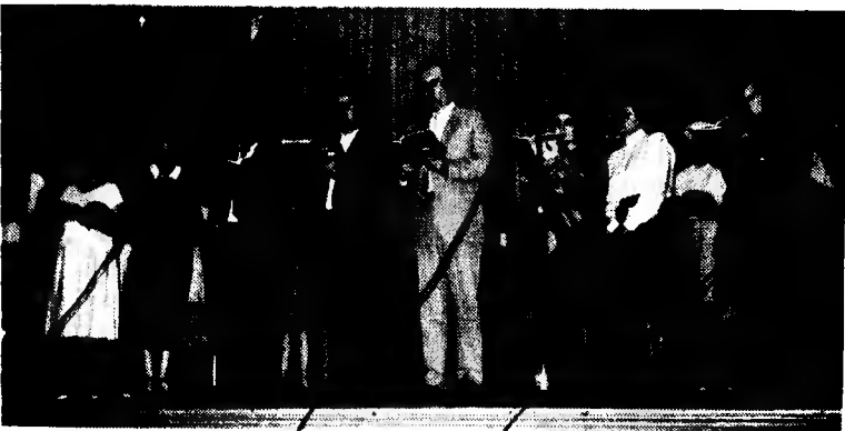
Holly Hill Pentecostal Holiness Church