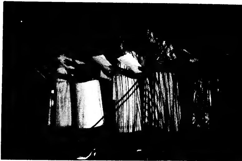
Juniper Chapel FWB Church