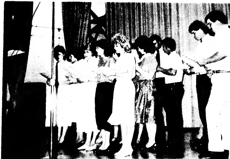
New Haven FWB Church Young Adult Choir

And the people came to the 1986 Fall Song Fest at Farm Life Elementary School