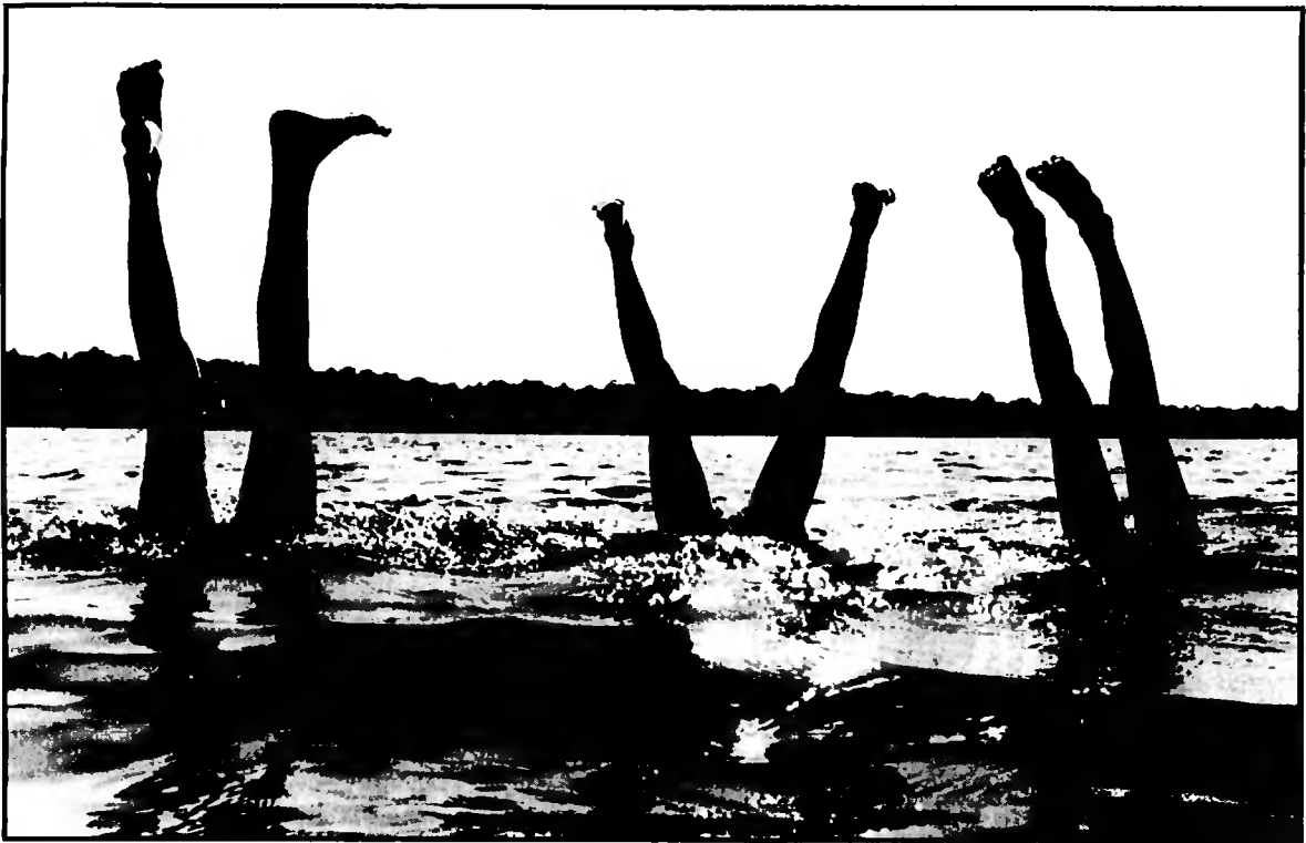
Still Wet Behind The Ears

"Ok. Let's go," I said. Thus began our plans and anxious wait. Would we get an invitation? We had served in England while I was on sabbatical leave in 1982-83 and knew the