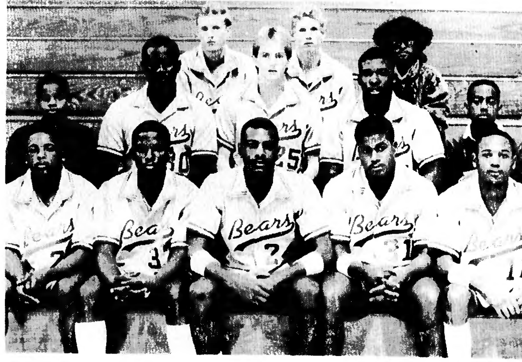
Bear Grass Bears