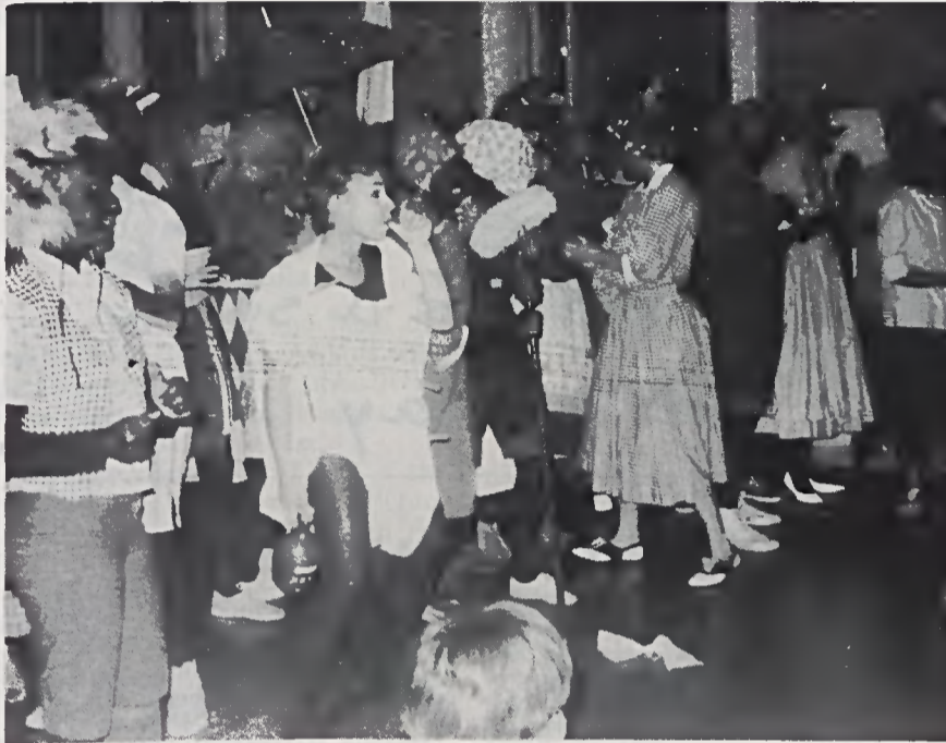
Freshman Slaves line in readiness prior to being auctioned at the Annual Freshman Slave Sale.